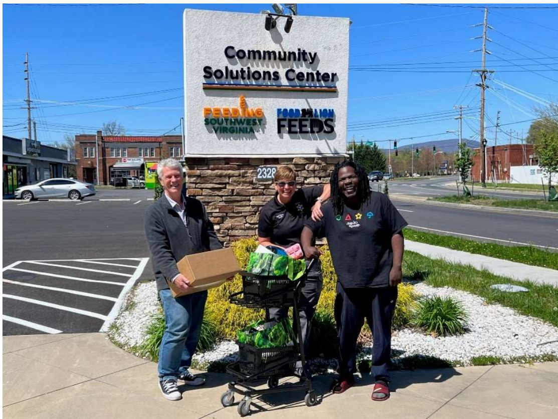
Above: Sheriff Staton volunteering at the Community Solutions Center

Among other volunteer activities, Sheriff Staton spent time at Feeding Southwest Virginia Community Solutions Center, a neighborhood food pantry that provides healthy foods and kitchen staples to neighbors in the greater Roanoke City area.