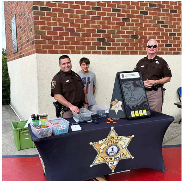
Above: Good times with friends at the courthouse and around town